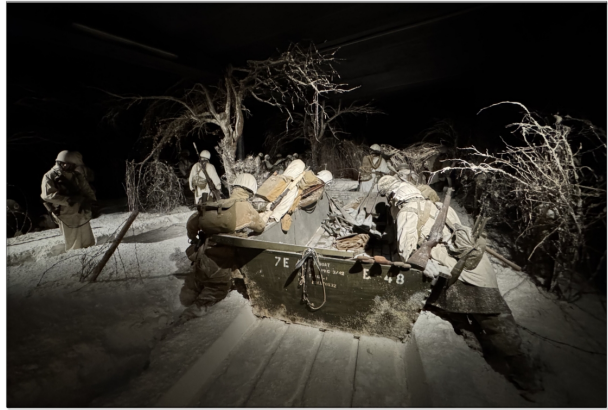
Original Sauer Crossing scene near Bettendorf in 1944-1945, pictured by US Army (left) and Sauer Crossing Diorama at the National Museum of Military History of Luxembourg (MNHM) in Diekirch by bp_Oct. 7, 2024 (right).