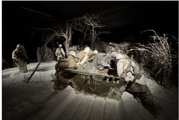
Original Sauer Crossing scene near Bettendorf in 1944-1945 pictured by US Army (left) and Sauer Crossing Diorama at the National Museum of Military History of Luxembourg (MNHM) in Diekirch by bp_Oct. 7, 2024 (right).